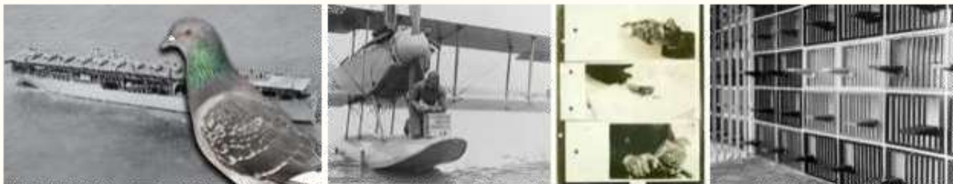
Carrier pigeons release from a Langley seaplane, Navy guidance on proper method of holding a pigeon in the hand, and Langley pigeon loft