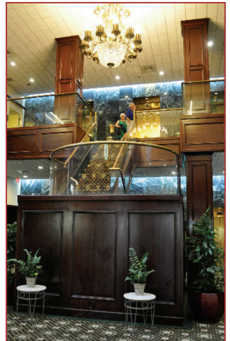
The Pensacola Grand Hotel lobby. OS&AS held meetings and dinner upstairs.