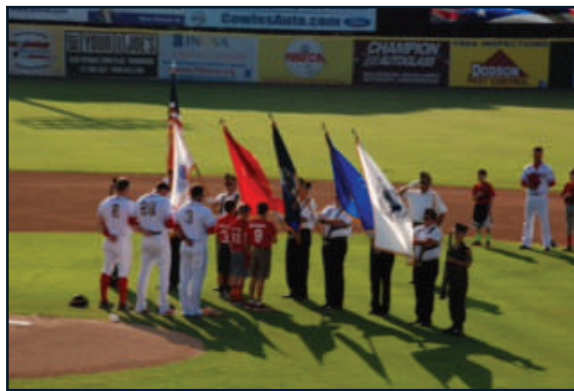
American Legion Post 10 Color Guard presents the American and service flags before the Potomac Nationals Military Appreciation Night.

That is a little of what I have done, but more importantly what the American Legion does for American Veterans and for the next generation; the youth of America. I spent the last weekend attending the American Legion Leadership College which gave me a greater appreciation for all the services that are offered from the traditional veterans' assistance, American Legion baseball, Boys State/Nation, and the oratorical contest which awards scholarship money to the high school competitors.