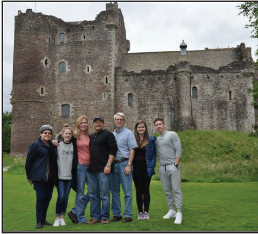
McLeod's at Doune Castle, Scotland