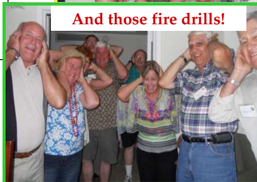
Fire drills, yes, but fortunately no tornado and no GQ.