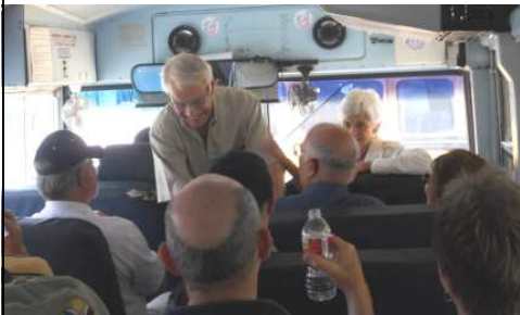
Worth Camp trying to follow directions.