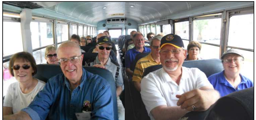
On the bus leaving for the WWII Museum. OS&AS was treated to a tour of the WWII Museum and watched Beyond All Boundaries , the WWII 4D movie experience featuring Tom Hanks. Photographs were restricted to protect the displays. So who is up front?