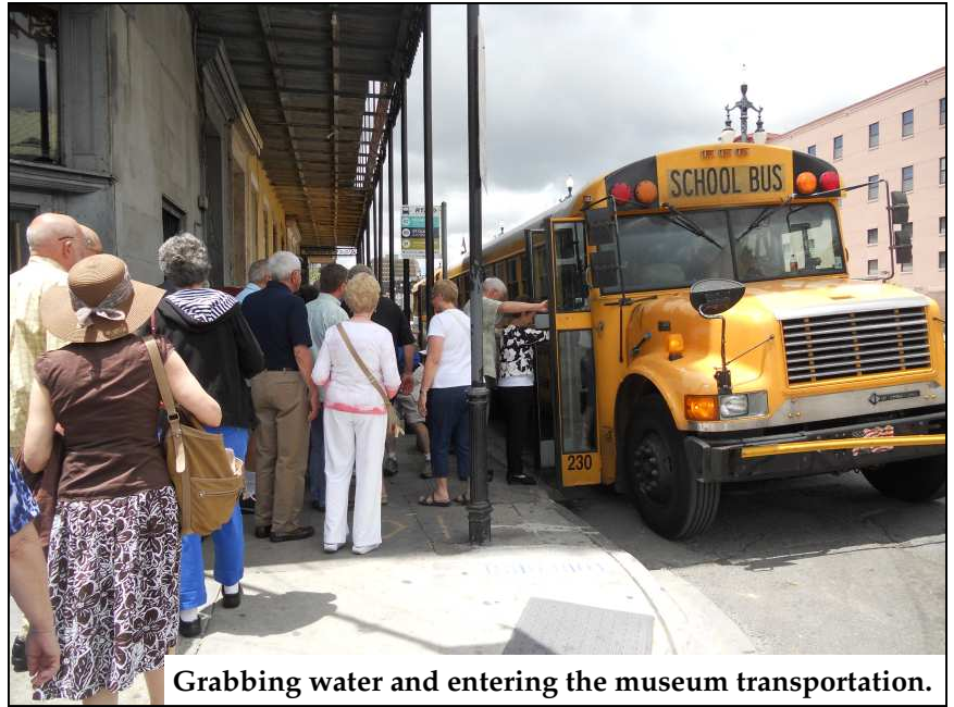
Grabbing water and entering the museum transportation.