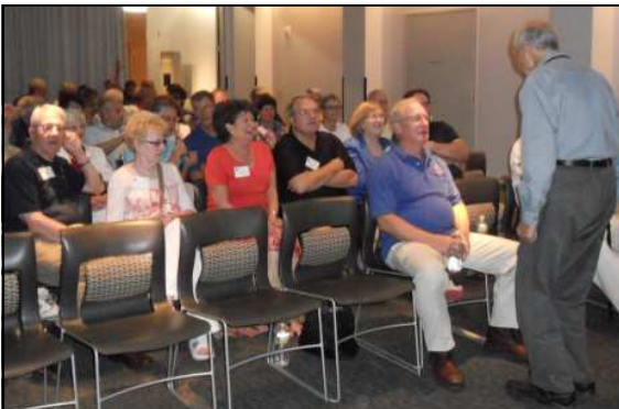
The speaker was a Pearl Harbor survivor.