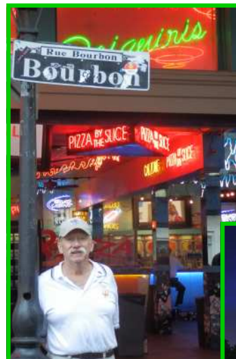
Saw the most exciting things . . .