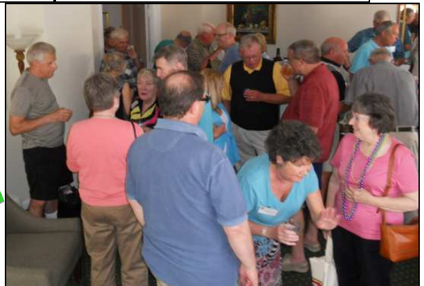
Hospitality Suite has standing room only.